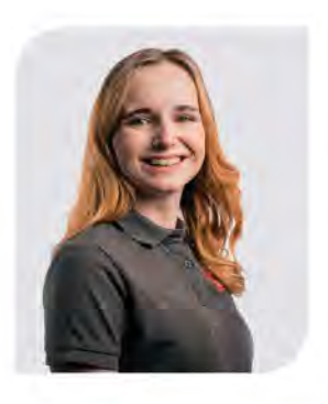
National Sales Manager - Power & Sewer